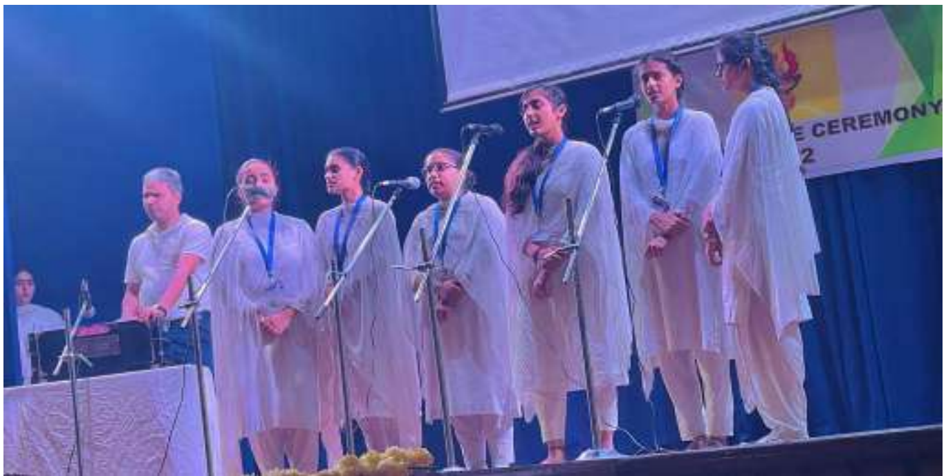
Investiture Ceremony at PSPS Govt P.G. College for Women, Gandhi Nagar