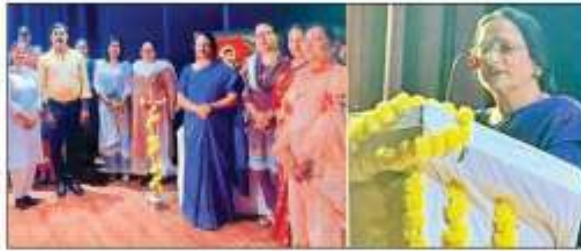
दीप प्रज्वलित करते हुए प्रबंधन व मीट को संबोधित करते हुए अधिकारी।

जम्मू, 6 सितंबर : सरकारी महिला कालेज गांधीनगर ने शैक्षणिक सत्र 2021-22 की अभिभावक शिक्षक बैठक आयोजित की गई। बैठक का शुभारंभ दीप प्रज्वलन के बाद सरस्वती वंदना से हुआ। बैठक का मुख्य उद्देश्य एक आम मंच बनाना था, जहां शिक्षक और माता-पिता छात्रों के शैक्षिक अनुभवों को समृद्ध करने और छात्रों के सर्वांगीण विकास के संबंध में विभिन्न मुद्दों पर चर्चा करने के लिए एक साथ आना था। शिक्षकों ने माता-पिता के साथ उन तरीकों पर भी